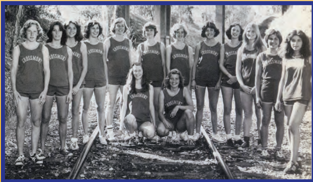
1977 FIRST GIRLS TRACK TEAM