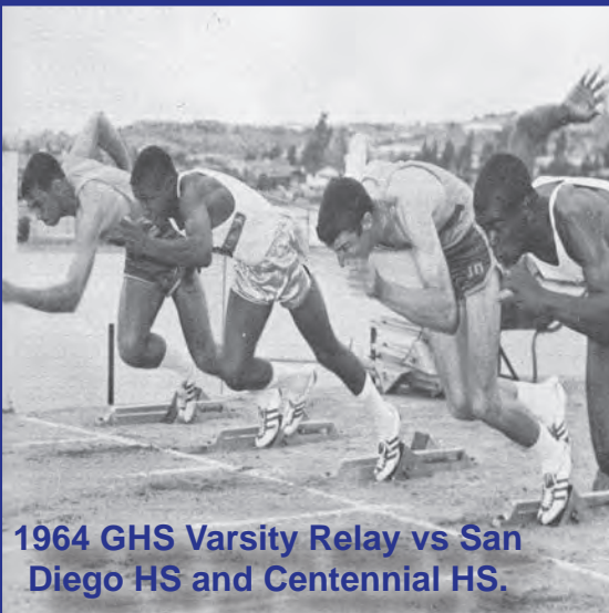
1964 GHS Varsity Relay vs San Diego HS and Centennial HS.

The annual tri-school pre-season meet was considered one of the feature attractions of the SD track season.