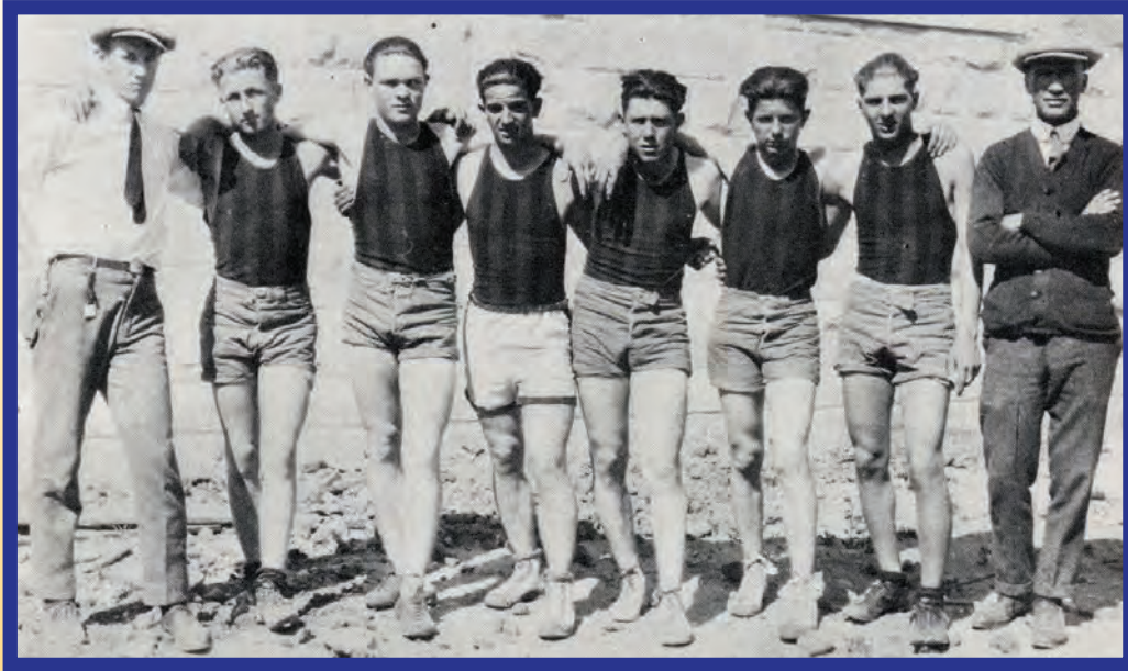
1923 BOYS TRACK TEAM