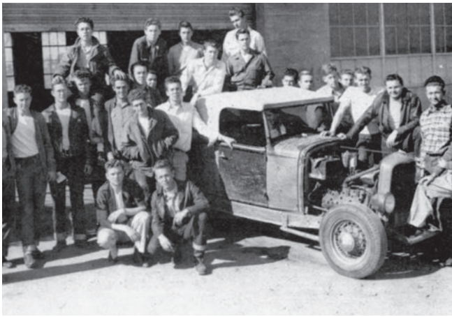
1948 AUTO SHOP