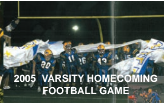
2005 VARSITY HOMECOMING FOOTBALL GAME