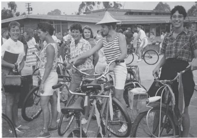
1961 SENIOR BIKE DAY