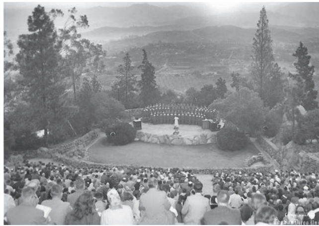
1958 RED ROBE CHOIR EASTER SUNRISE SERVICE