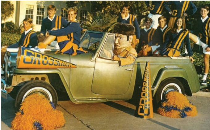
1969 GUS CHEER CAR