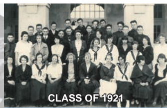
CLASS OF 1921