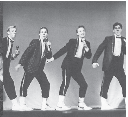
1985 FIRST ANNUAL AIR BANDS JELLY AND THE MARCELLS