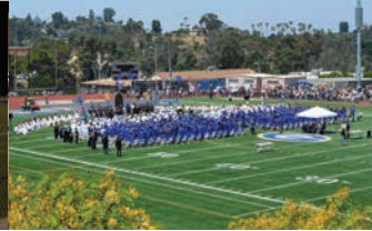
CLASS OF 2017 GRADUATION