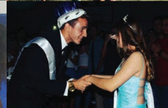
2016 HOMECOMING KING AND QUEEN