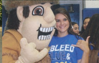
2015 GUS AND FRIEND