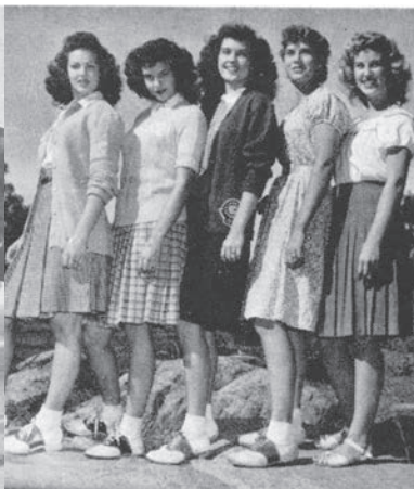
1947 BOBBY SOCK GIRLS