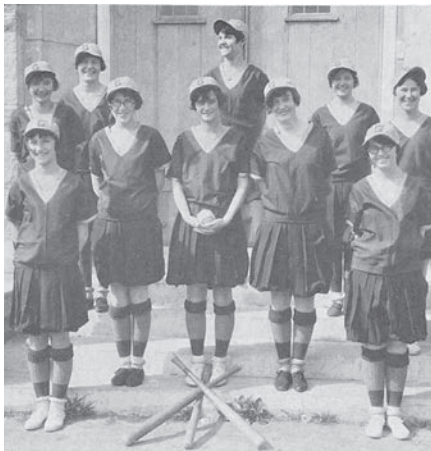
1927 INDOOR GIRLS BASEBALL TEAM