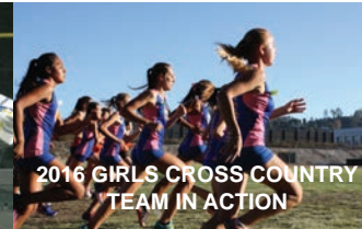
2016 GIRLS CROSS COUNTRY TEAM IN ACTION