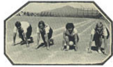
1933 Girls (with Cowles Mountain in the background)