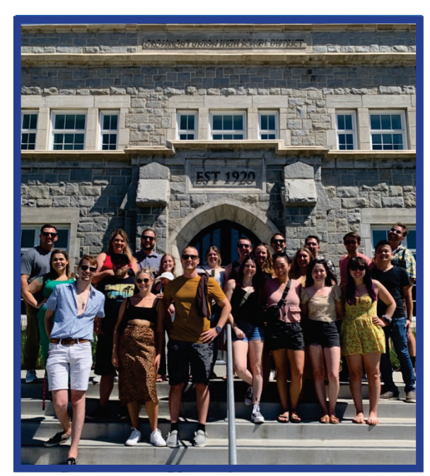
Class of 2013 Tours the Campus