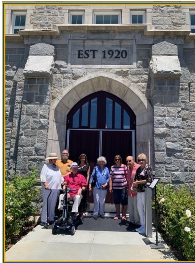
Class of 1958 and Guests