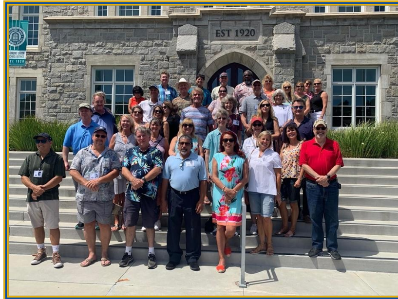
Classes of 1980, 1981, and 1982

At the end of July, the Classes of 1980, 1981, and 1982 spent two hours touring the campus, inside the “Castle” and various high school buildings including the Old Gym, the new school office, as well as the Performing Arts complex. Standing on the Old Gym stage, they enjoyed reliving Christmas Pageant memories and then later sang again from the new theater stage.