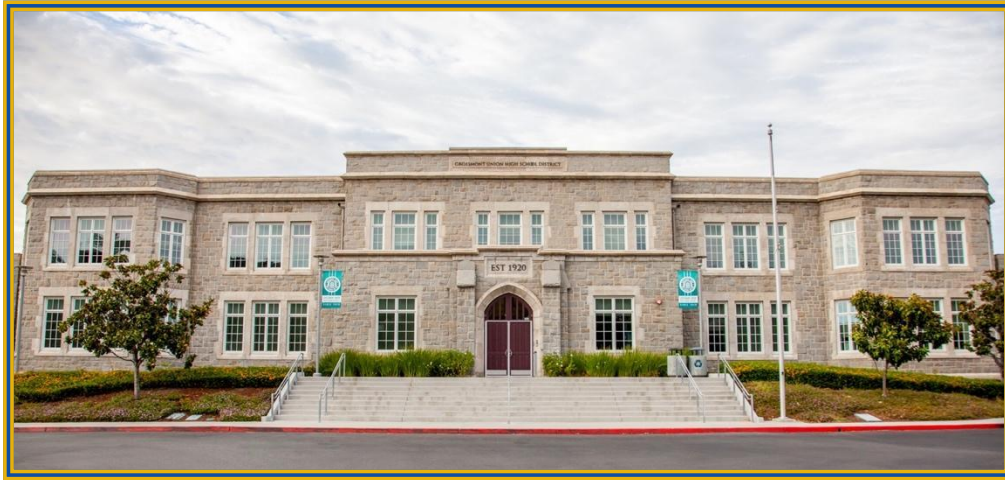
1922 Castle Today